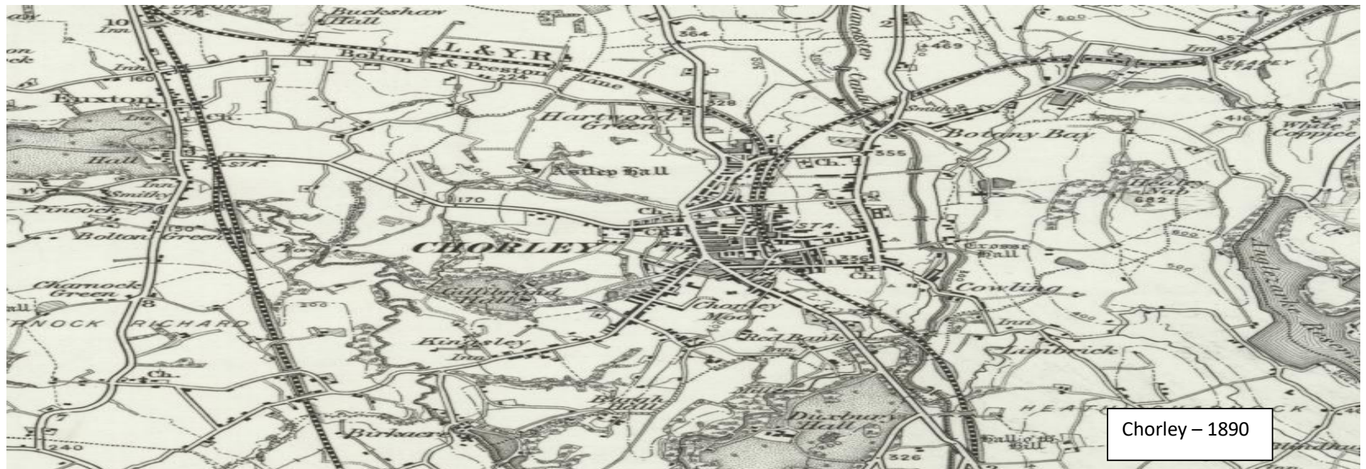
Chorley – 1890